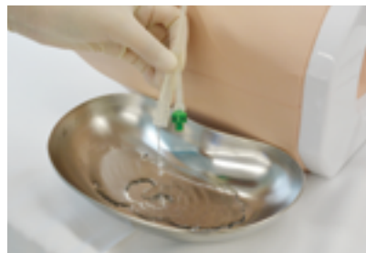
Confirmation of proper discharge of urine.