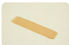
11442-010 Skin for tracheostomy (set of 3)