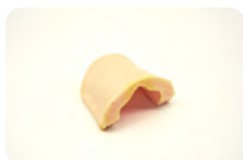
11442-020 subcutaneous tissue for tracheostomy (set of 3)